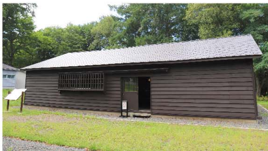
Cultural Properties Designated by Shibecha Former Ekiyeisho

The original Shuchikan (types of prisons) building, constructed in 1886, was located where the current Shibecha high school now stands. After the termination of the Shuchikan, the building's office was used by a variety of institutions. The Shuchikan building was reconstructed at its current place in 1969 and became the Shibecha Folk Museum from 1970 until 2017.