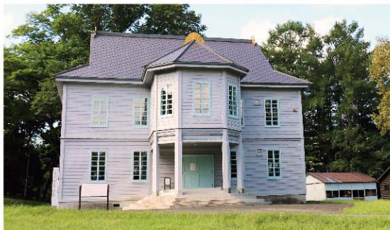
Cultural Properties Designated by Shibecha Hokkaido Shuchikan Kushiro Branch, Main Building

The original Shuchikan (types of prisons) building, constructed in 1886, was located where the current Shibecha high school now stands. After the termination of the Shuchikan, the building's office was used by a variety of institutions. The Shuchikan building was reconstructed at its current place in 1969 and became the Shibecha Folk Museum from 1970 until 2017.